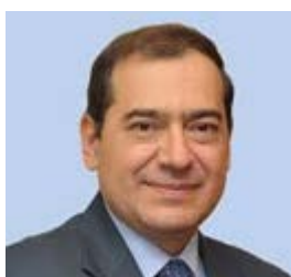
His Excellency Tarek El Molla

REGISTER TO MEET 270+ ENERGY MINISTERS, GLOBAL CEOs, AND LEADING DECISION MAKERS SPEAKING AT EGYPSS 2020