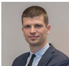
Pál Ságvári Ambassador-at-Large for Energy Security Ministry of Foreign Affairs and Trade Hungary