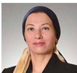
Her Excellency Yasmine Fouad

Minister of Petroleum and Mineral Resources Arab Republic of Egypt