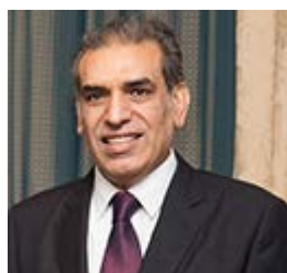
Ashraf Farag First Undersecretary for Agreements and Exploration Ministry of Petroleum and Mineral Resources Arab Republic of Egypt