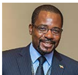
His Excellency Gabriel Mbaga Obiang Lima Minister of Mines and Hydrocarbons Republic of Equatorial Guinea