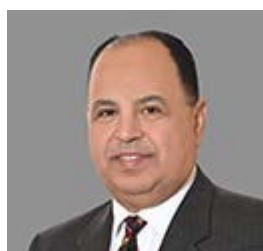
His Excellency Dr Mohamed Ahmed Maait Minister of Finance Arab Republic of Egypt

Minister of Environment Arab Republic of Egypt